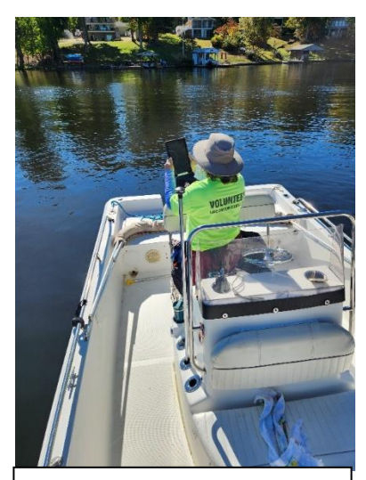
LGA volunteer Judy Waters enters survey data into a handheld

The 2023 LGA Volunteer Aquatic Vegetation Survey wrapped up the last week of October. The survey was conducted by approximately 100 LGA volunteers who surveyed nearly 350 miles of shoreline. There are 114 survey sections, 100 that were completed by the LGA volunteers - the other 14 sections were surveyed by North Carolina State University (NCSU) staff. The LGA volunteers invested nearly 500 hours of time with a "value" of approximately $15,000 to complete the survey. There was a myriad of aquatic plant species sampled, identified, and documented as part of the effort. Native plants such as water willow, American white-water lily, watershield, arrowhead and others were documented in various locations on the lake. In addition, invasive/noxious species such as lyngbya and hydrilla were also documented in locations around the lake. The LGA volunteer survey is a critical component of the larger effort to manage aquatic vegetation at Lake Gaston.